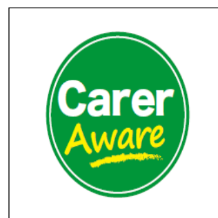
Support for young carers