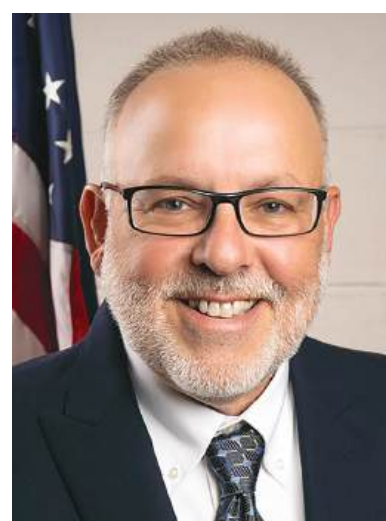
Utica Mayor - Gus Calandrino