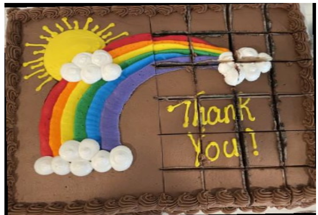
And of course, no party is complete without cake!