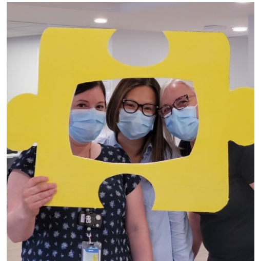
Everyone at Pearson Place is an important piece of the puzzle