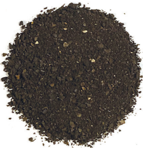
Black walnut hull

Do an inner cleanse with Para 90 every three months.